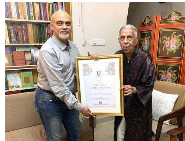
Justice M N Venkatachaliah Former Chief Justice of India