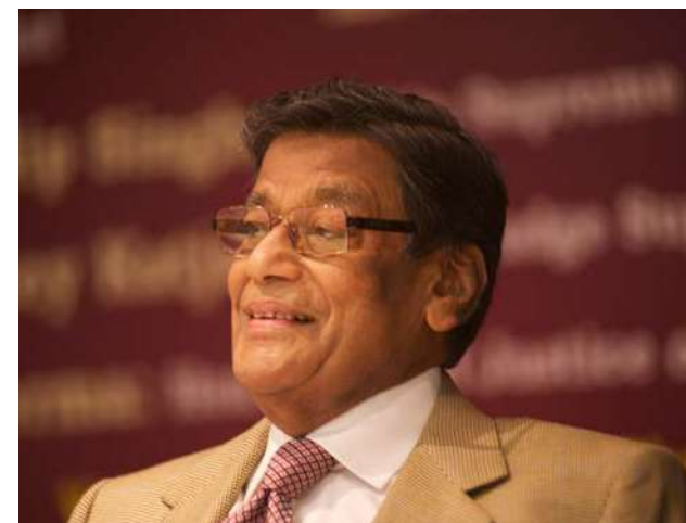
Mr K K Venugopal Former Attorney General of India