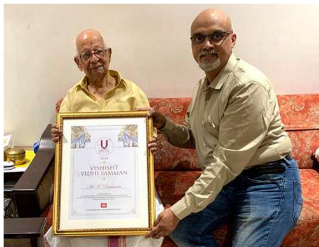
Mr K Parasaran Former Solicitor General of India