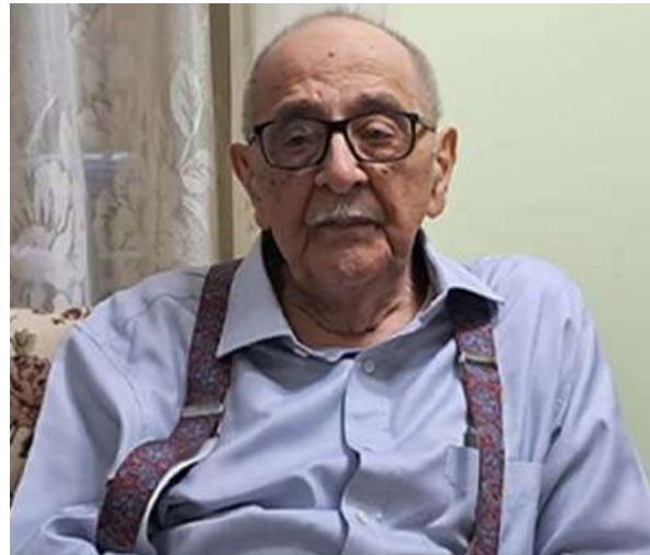
Late Mr Fali S Nariman